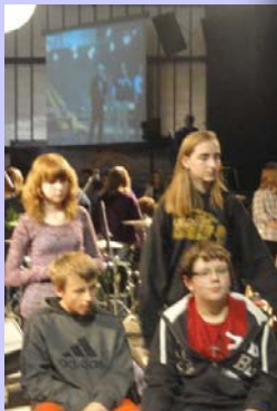
Students playing "Honey, if you love me, please smile" @ Flame On 2012

"Acknowledge that the Lord is God! He made us, and we are His. We are His people, the sheep of His pasture."