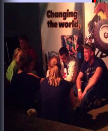
LIT's leading during small group discussion.

I Loved being in a place where you feel absolutely comfortable to just open your heart up completely to God! It's a start! Now its time to spread the word! :) Tara