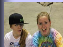
Students hanging out at Flame On 2011