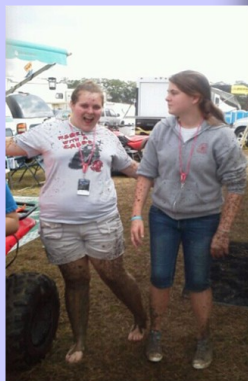
CMA Youth Movement students @ the Thor National Mini Olympics, Gatorback MX Park near Gainesville, FL.

Now we are preparing for another favorite event during the year, Flame On 2012 Student Rally. What an amazing time when students from all over the country join each other on Iron Mountain to enjoy great fellowship, to be equipped to live a life on fire for Christ and best of all ringing in the New Year in the presence of God. We can't wait to hear what God would speak into the hearts of students that will be attendance. See you all there!